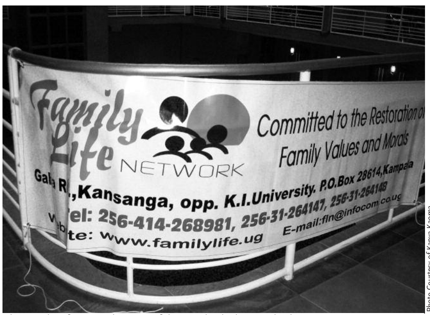
The Family Life Network is one of the U.S.-backed evangelical organizations exerting influence in African dioceses. The group hosted the Uganda Anti-Gay Conference in March 2009.

tive view of U.S. mainline churches. In Kenya, one urban congregation asked Archbishop Benjamin Nzimbi not to interfere with its relationship with TEC congregations, and a number of Anglican bishops there continue to accept funding from TEC.<sup>36</sup> Similarly, the Presbyterian Church in Kenya accepts